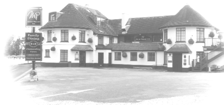
Mount Pleasant Inn Dawlish Warren Tel: (01626) 863151